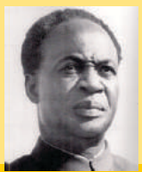
Dr. Kwame Nkrumah, FGA 1961 - 1966